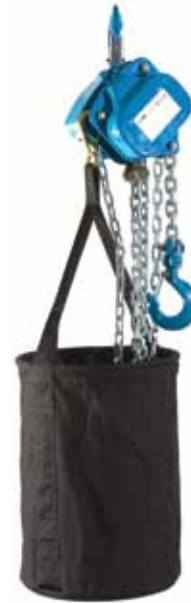
Bucket bag - holds hand and load chains after lift is finished