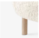
→ Moonlight & Oak