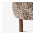
→ Sahara & Walnut