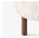
→ Moonlight & Walnut