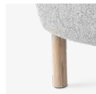
→ Hallingdal 130 & Oak