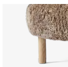
→ Sahara & Oak