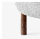
→ Hallingdal 130 & Walnut