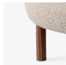
→ Karakorum 003 & Walnut