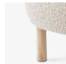
→ Karakorum 003 & Oak