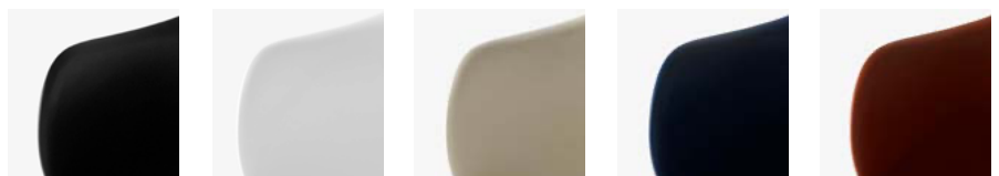
Black White Soft Beige Midnight Blue Copper Brown