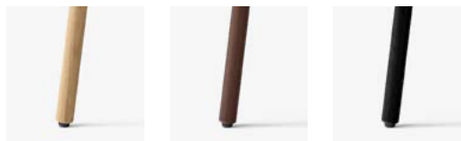
Lacquered oak lacquered walnut Black lacquered oak