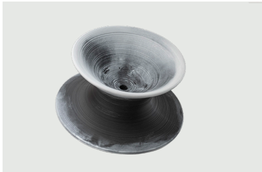
Bicolour - Grey Anthracite / Light grey