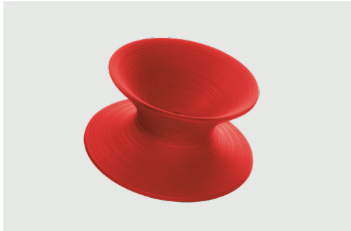
Red 1004 C