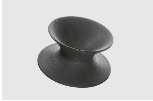
Grey Anthracite 1428 C