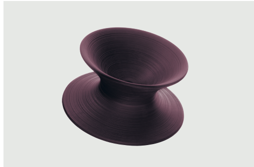
Dark Purple 1133 C