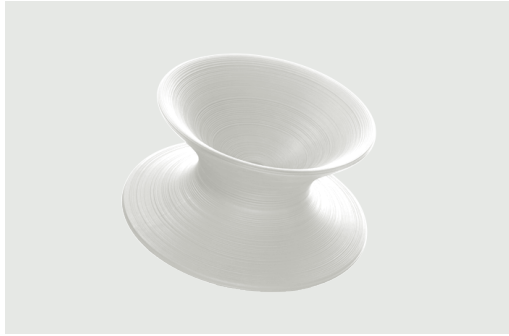
White 1735 C