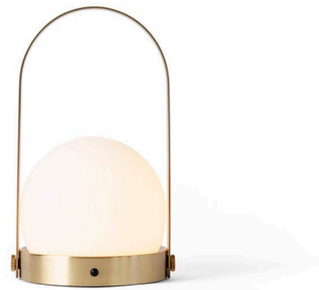
Brushed Brass 4863539