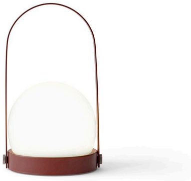
Burned Red 4863349