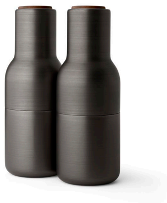
Bronzed Brass 4415859