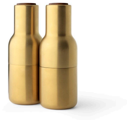
Brushed Brass 4415839