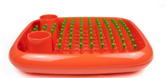
Dish-rack / Orange 1090 C Caps / Green