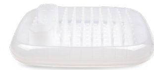
Dish-rack / Clear 2080 TL Caps / Clear