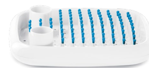
Dish-rack / White 1690 C Caps / Blue