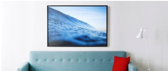
Photo printed on paper then stuck to a 1mm thick aluminium plate or under plexi. No glass, the print is installed on a 4 cm deep mount. With 1 cm emptiness between its sides and the wood frame