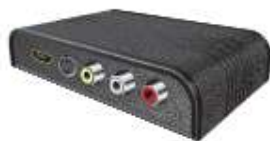
CVBS/S-Video to HDMI converter Manual