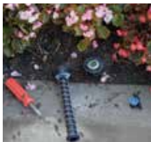
Easily retrofits to Rain Bird 1800 Series

Why pay for a body you're just going to throw away? I-PRO offers a 4", 6" and 12" replacement spray head that is everything but the body! Ideal for maintenance, this spray head also fits right in the can of the Rain Bird® 1800® series for an easy retrofit. With features that are contractor-driven and field-proven, the I-PRO Series is sure to save you time and money.