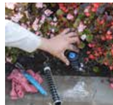
Drop in I-PRO replacement and retrofit is complete