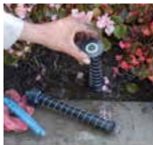
Remove the "guts" of Rain Bird 1806 spray head