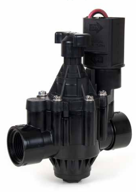
PGA Series Valve with TBOS Latching Solenoid

Whether the job calls for a globe or angle valve, PGAIVM Series valves are the right choice. Loaded with features, these heavyduty PVC valves are economical, easy to install and built to withstand constant 150 psi (10.35 bar) pressure and 2 to 150 gpm (0.45 to 34.05 m3/h; 7.8 to 568 l/m) flows.