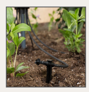
Use with XQ 1/4" Distribution Tubing; the strongest & most flexible tubing for emitters