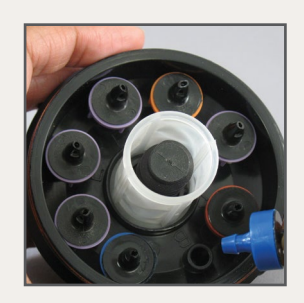
Always install emitters with the pointed end (inlet barb) or threaded end up, as shown

Eliminate water waste by direct watering potted plants. The manifold allows for increasing or decreasing future plant requirements.