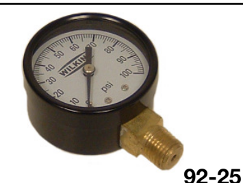
Model 25 Pressure Gauges