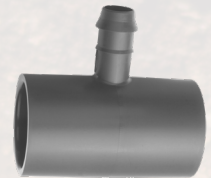
STD17-007 & STD17-010