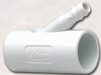
SY007 & SY010