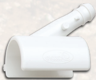
KSY007 & KSY010