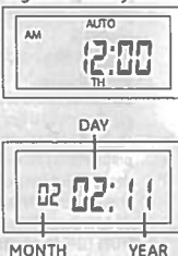
Figure 1 - Ready to set