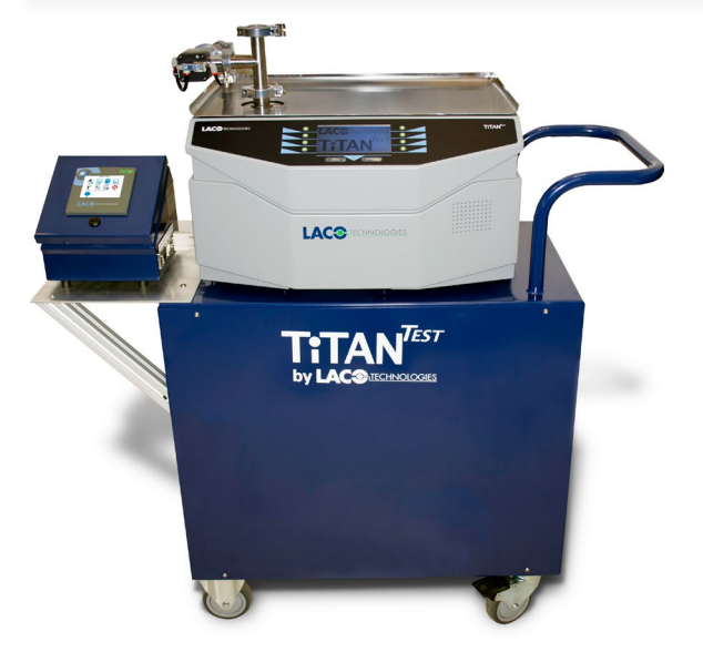
TitanTest™ TW28-CPX44 with TCM50-PT

The TitanTest™ Communication Module (TCM) adds powerful communication and data logging features to your TitanTest™ helium leak detector. The TCM is a small interface module packaged in a NEMA enclosure which includes a color touch screen interface, microprocessor, wired ethernet interface, data storage, web server, and serial barcode scanner interface.