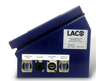
TCM50 I/O ports