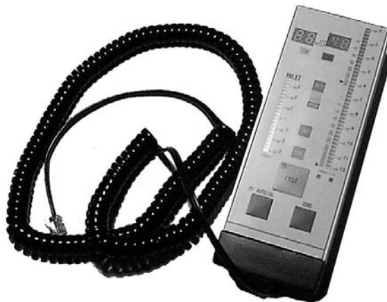
Fig. 2: Standard remote control

The standard remote control can be used with all the ASM xxx leak detectors, excepted the ASM 102 S and ASM 142 S.