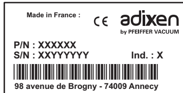
Fig. 1: Identification label