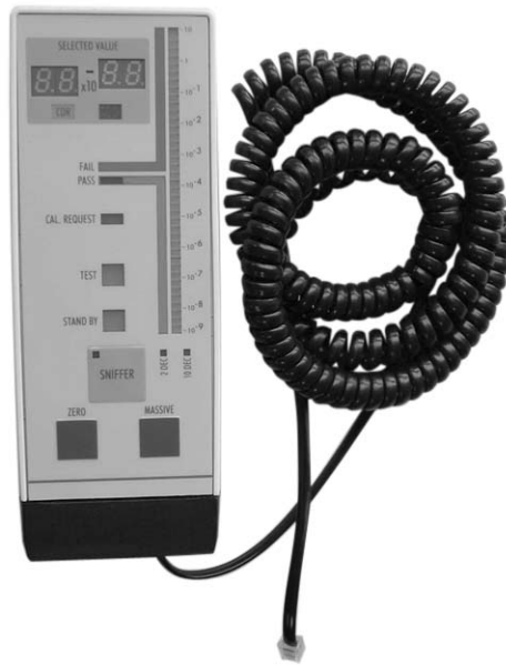
Fig. 3: Special sniffing remote control

The special sniffing remote control for sniffing leak detectors must be used only with the ASM 102 S and ASM 142 S.