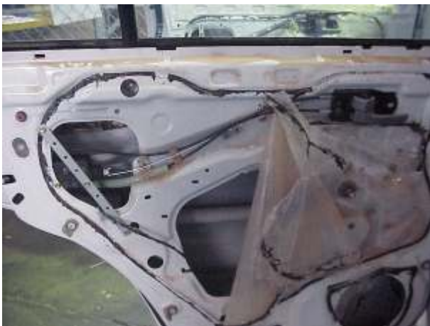
Completed rear passenger side door.