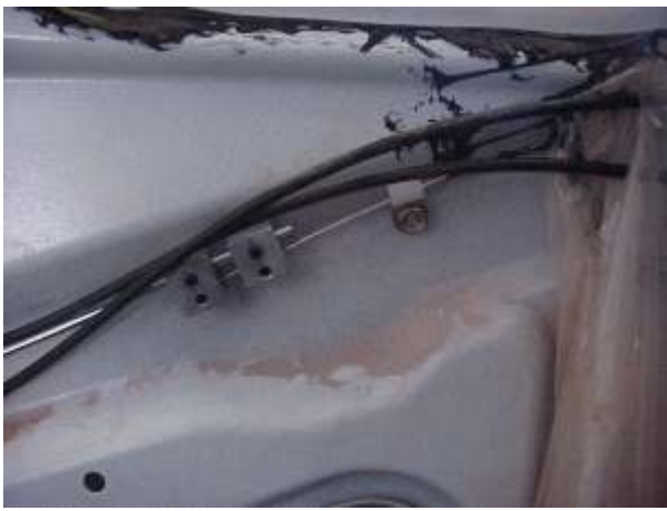
Ensure knuckles and nylon guides sit within channel to ensure moving parts have clearance from door trim.