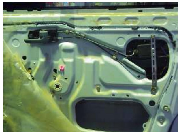
Finished driver's side front door.