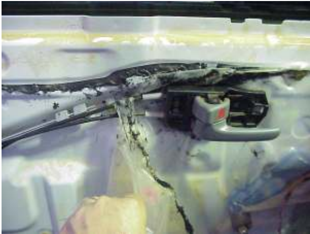
Ensure knuckles and nylon guides sit within channel to ensure moving parts have clearance from door trim.