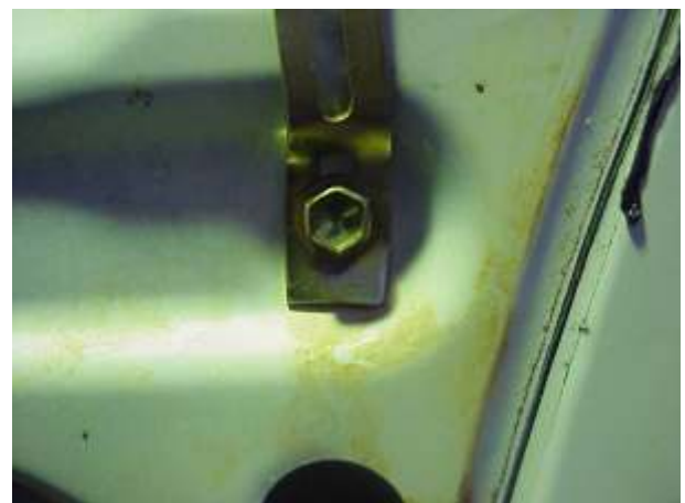
Recess mounting bolts into channels where possible.