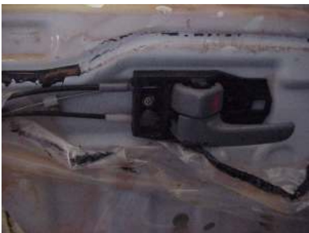
Rod must slide unobstructed into door release handle assembly.