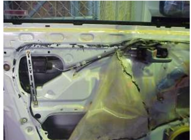
Completed front passenger side door.