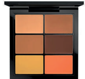
MAC Studio Conceal and Correct Palette in Dark ( £30 )