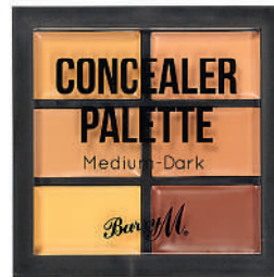
Barry M Concealer Palette in Medium/Dark ( £5.99 )

Two full coverage concealer palettes with six shades to conceal, contour and illuminate the complexion. The choice is yours!