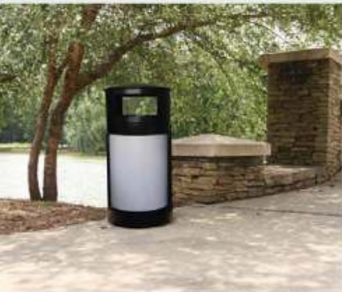
Containers offer many years of trouble-free service.