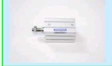
Cuff Clamp Cyl, 2set CPS30-108