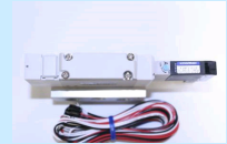
Solenoid For Press Cyls CPS30-003

*Parts Number correspond to Equipment Serial: 4N2-0231-1-129 to as of writing. Please refer to your user manual for correct part number for your equipment. This part reference is not exhaustible.