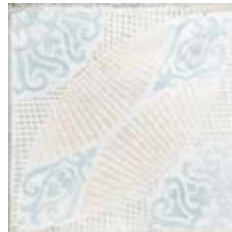
6" x 6" Barcelona Guell Decor 66BARGUE