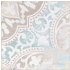
6" x 6" Barcelona Montjuic Decor 66BARJUI