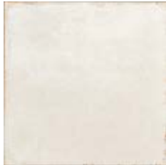
6" x 6" Barcelona Porcelain 66BARPOR