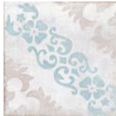
6" x 6" Barcelona Sarria Decor 66BARSAR