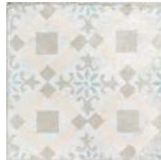
6" x 6" Barcelona Born Decor 66BARBOR