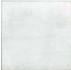
6" x 6" Barcelona All White 66BARAWT