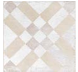
6" x 6" Barcelona Sants Decor 66BARSTS