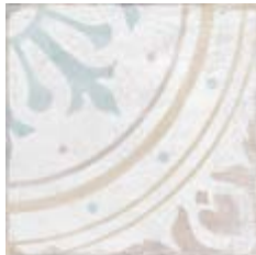
6" x 6" Barcelona Raval Decor 66BARRAV