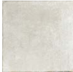
6" x 6" Barcelona Stone 66BARSTO