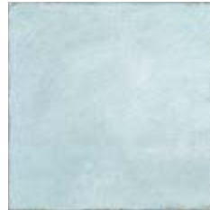
6" x 6" Barcelona Ocean 66BAROCN