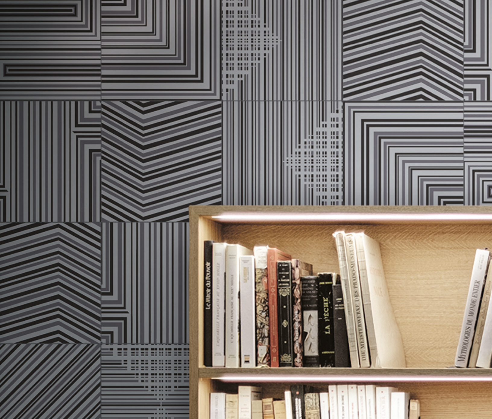
Cover and above photos feature Geometric Fusion™ Graphite 8 x 8 on the wall.