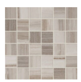
TURKISH SKYLINE MA86