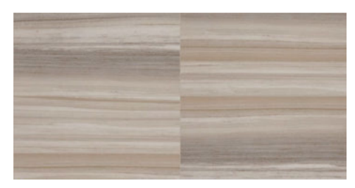
TURKISH SKYLINE MA86