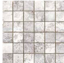
Shore Mosaic 2" X 2" on 13" X 13" Mesh Mosaic F84CABOSH1313MO2