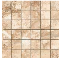
Coast Mosaic 2" X 2" on 13" X 13" Mesh Mosaic F84CABOCO1313MO2