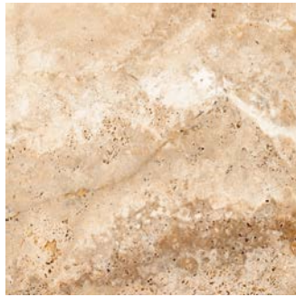
Coast 17"x17" F84CABOCO1717 13"x13" F84CABOCO1313 12"x24" F84CABOCO1224