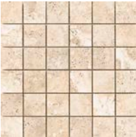
Beach Mosaic 2" X 2" on 13" X 13" Mesh Mosaic F84CABOBE1313MO2