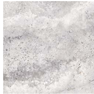
Shore 17"x17" F84CABOSH1717 13"x13" F84CABOSH1313 12"x24" F84CABOSH1224