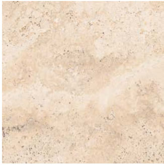
Beach 17"x17" F84CABOBE1717 13"x13" F84CABOBE1313 12"x24" F84CABOBE1224