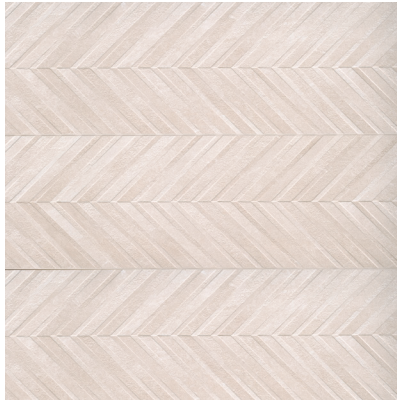
Cream - CRE DECTEXCRE1647 16"x47" Textured Design Wall Tile - Matte