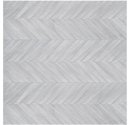
Grey - GRE DECTEXGRE1647 16"x47" Textured Design Wall Tile - Matte