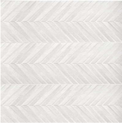
White - WHI DECTEXWHI1647 16"x47" Textured Design Wall Tile - Matte