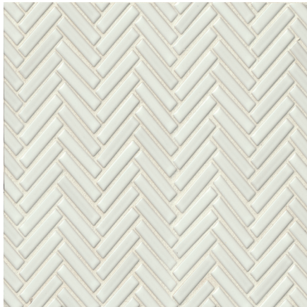
White - WHI DEC90WHI122MO

1/2"x2" Herringbone Mosaic (11"x12 1/4" Sheet)