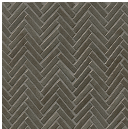
Metallic - MET DEC90MET122MO