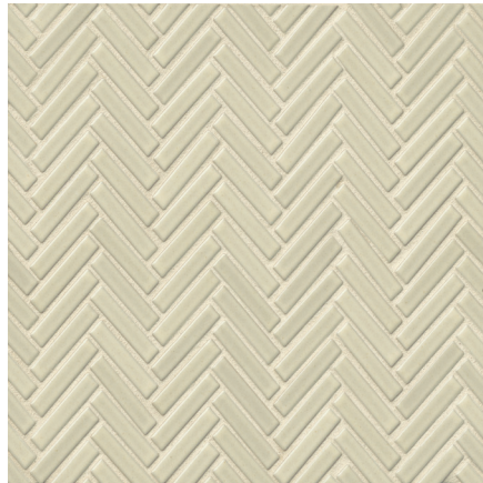
Off White - OFW DEC90OFW122MO