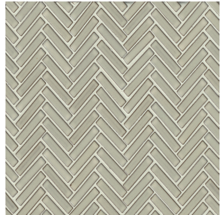
Putty - PUT DEC90PUT122MO