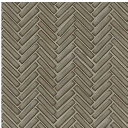
Gray Haze - GRH DEC90GRH122MO