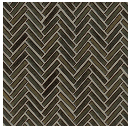
Shadow - SHA DEC90SHA122MO