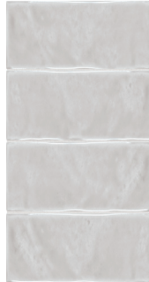
3 x 6 in (7.5 x 15 cm) MARLOW MIST GLAZED CERAMIC GLOSSY 4000-0079-1