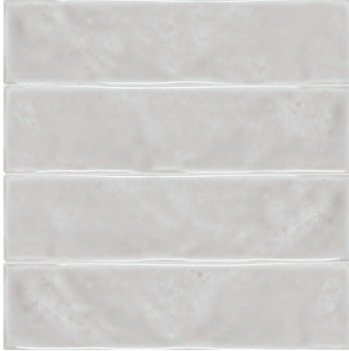
3 x 12 in (7.5 x 30 cm) MARLOW MIST GLAZED CERAMIC GLOSSY 4000-0078-1