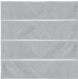
3 x 12 in (7.5 x 30 cm) MARLOW SMOKE GLAZED CERAMIC GLOSSY 4000-0080-1