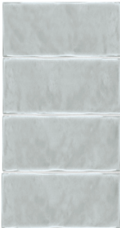
3 x 6 in (7.5 x 15 cm) MARLOW TIDE GLAZED CERAMIC GLOSSY 4000-0083-1