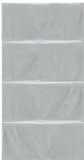
3 x 6 in (7.5 x 15 cm) MARLOW SMOKE GLAZED CERAMIC GLOSSY 4000-0081-1