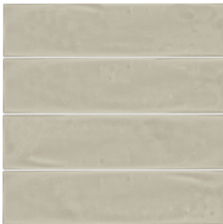
3 x 12 in (7.5 x 30 cm) MARLOW EARTH GLAZED CERAMIC GLOSSY 4000-0076-1