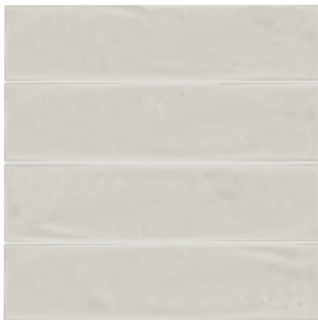
3 x 12 in (7.5 x 30 cm) MARLOW DESERT GLAZED CERAMIC GLOSSY 4000-0074-1