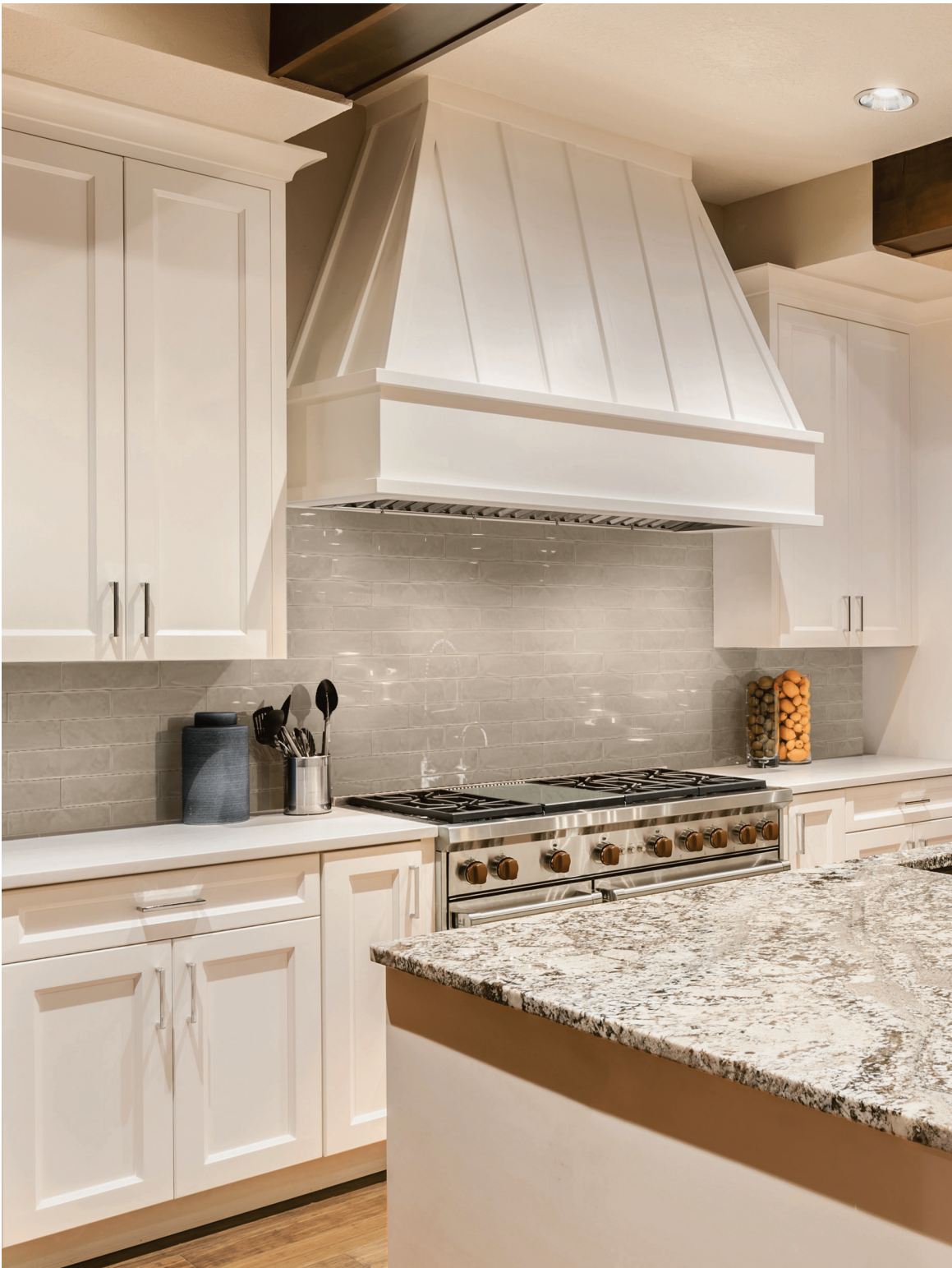
3 x 12 in (7.5 x 30 cm) MARLOW MIST GLOSSY GLAZED CERAMIC