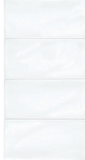
3 x 6 in (7.5 x 15 cm) MARLOW CLOUD GLAZED CERAMIC GLOSSY 4000-0072-1, MATTE 4000-0073-1