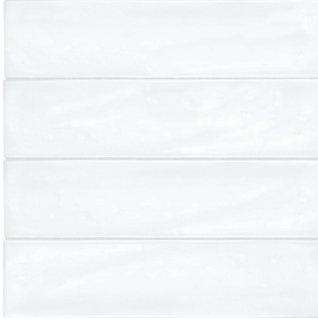
3 x 12 in (7.5 x 30 cm) MARLOW CLOUD GLAZED CERAMIC GLOSSY 4000-0070-1, MATTE 4000-0071-1