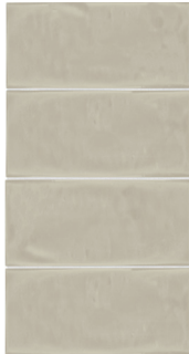
3 x 6 in (7.5 x 15 cm) MARLOW EARTH GLAZED CERAMIC GLOSSY 4000-0077-1