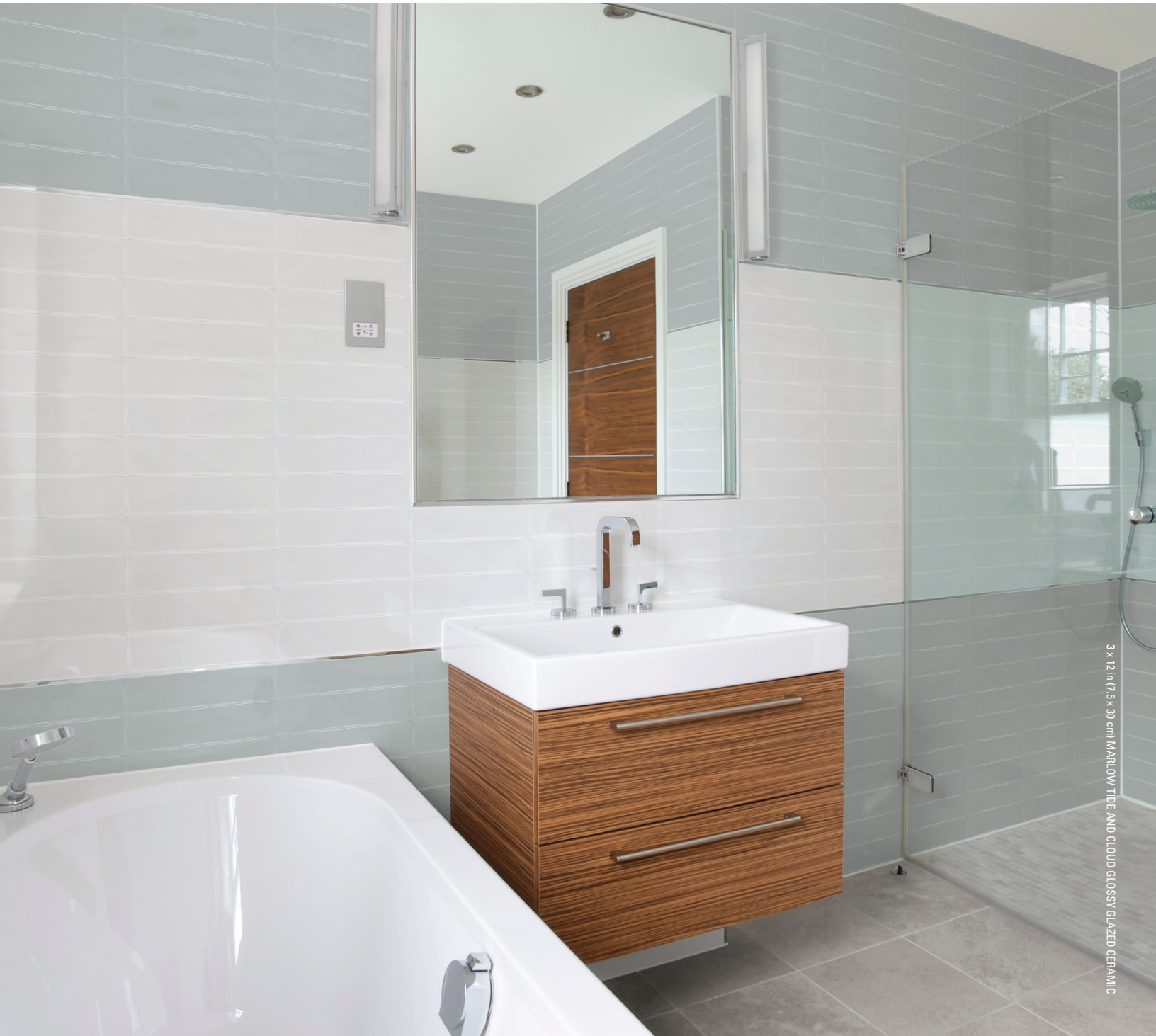
3 x 12 in (7.5 x 30 cm) MARLOW TIDE AND CLOUD GLOSSY GLAZED CERAMIC