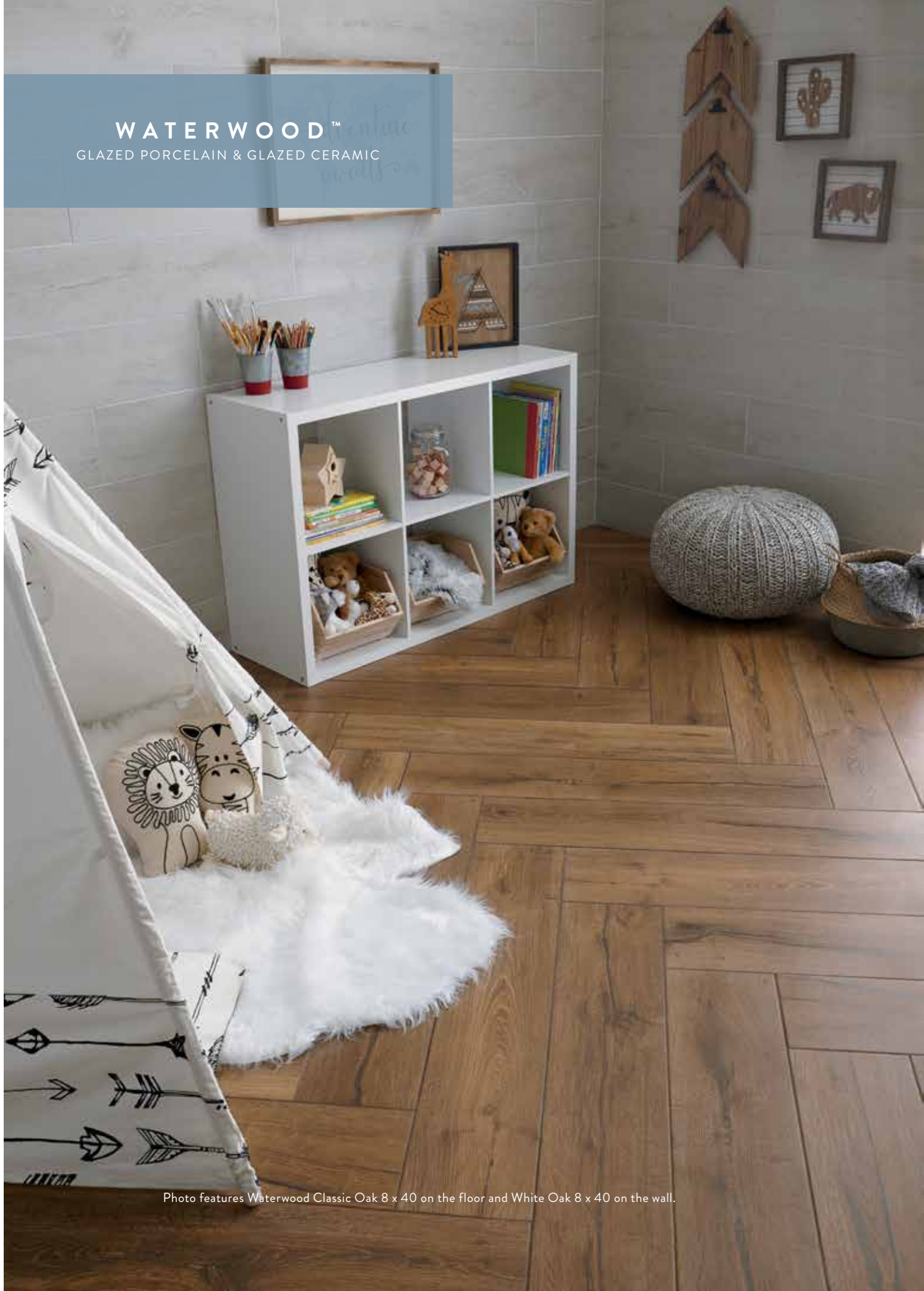
Photo features Waterwood Classic Oak 8 x 40 on the floor and White Oak 8 x 40 on the wall.