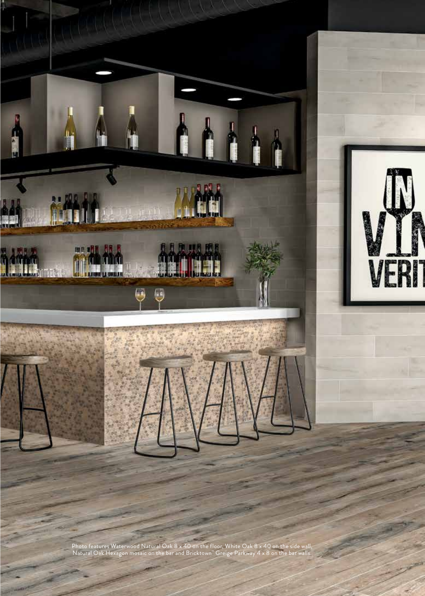
Photo features Waterwood Natural Oak 8 x 40 on the floor, White Oak 8 x 40 on the side wall, Natural Oak Hexagon mosaic on the bar and Bricktown™ Greige Parkway 4 x 8 on the bar walls.