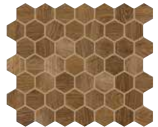
CLASSIC OAK WD17