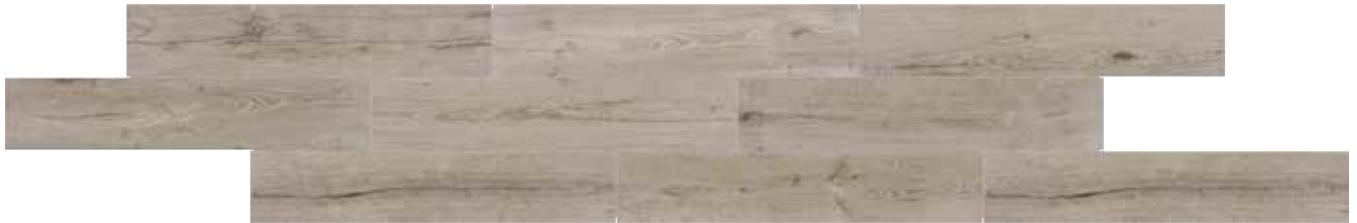
WEATHERED OAK WD18