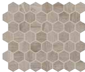
WEATHERED OAK WD18