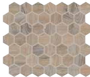
NATURAL OAK WD16