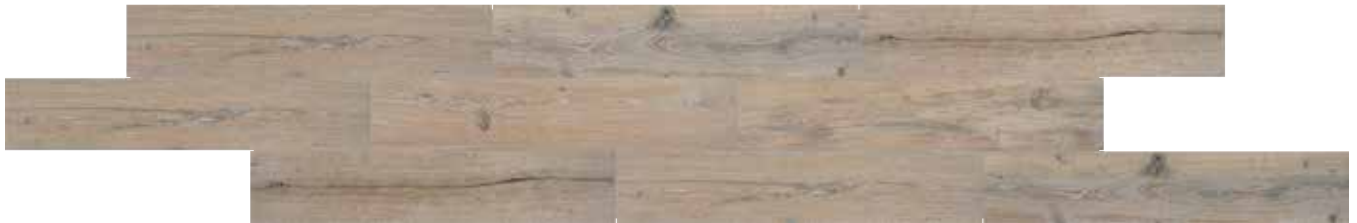
NATURAL OAK WD16