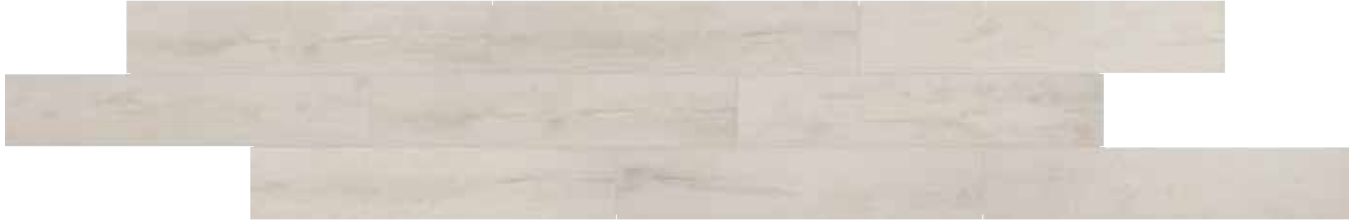
WHITE OAK WD15