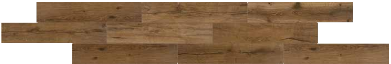
CLASSIC OAK WD17