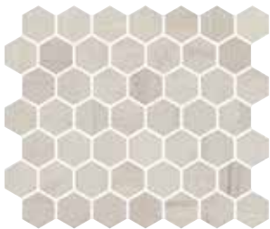
WHITE OAK WD15