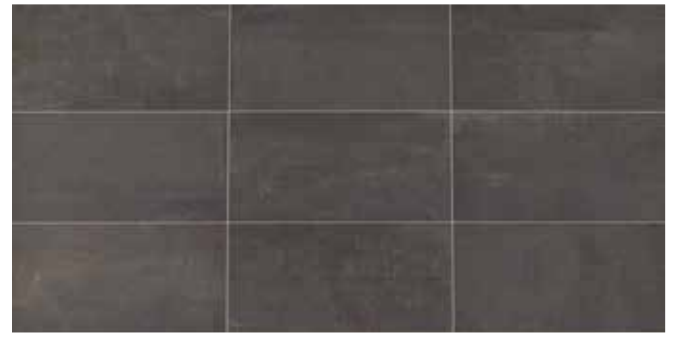
BLACK NICKEL UN05