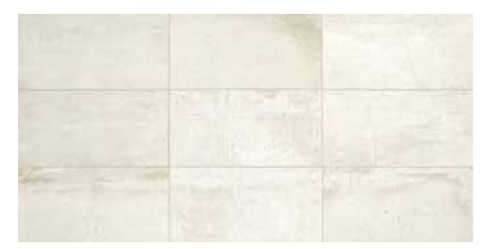
PLATINUM WHITE UN01