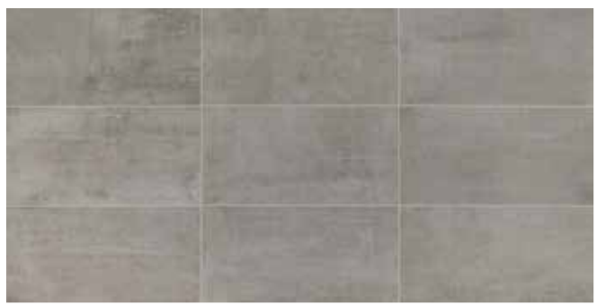
INDUSTRIAL GRAY UN03