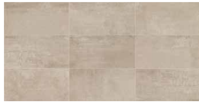
WEATHERED BEIGE UN02