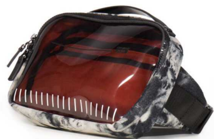
BAT WAIST BAG