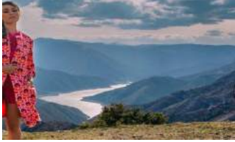
Mad About Macedonian Style