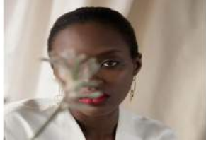
The Latest Collection From Matt