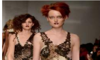
Eco-Goth: Mimi New York at