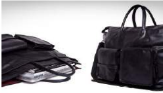
Where Does Leather Come