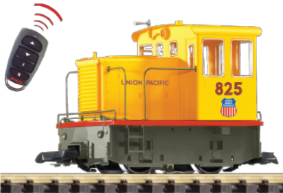
38504: UP R/C GE 25-Ton Diesel