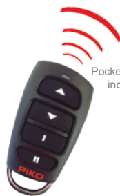
Pocket remote included

Simple 4-button pocket remote controls speed and direction, plus emergency stop. Also switches accessory power on/off.