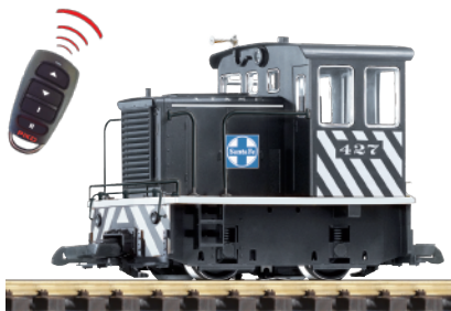
38503: SF R/C GE 25-Ton Diesel