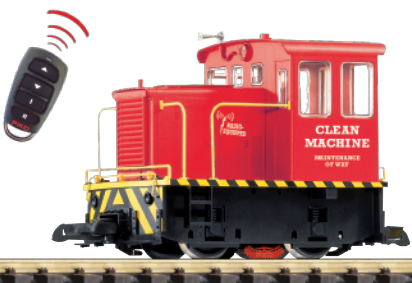
38506: Clean Machine R/C - Track Cleaning Loco