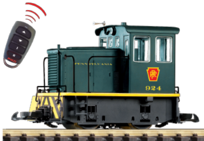
38505: PRR R/C GE 25-Ton Diesel