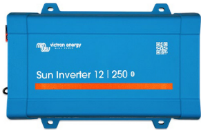
Sun Inverter 12/250

12V | 250VA and 24V | 250VA - 230V, 50Hz or 60Hz