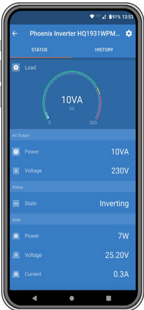
The VictronConnect app