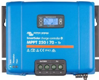
SmartSolar Charge Controller MPPT 250/70-Tr with optional pluggable display