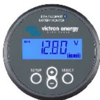
Bluetooth sensing: BMV-712 Smart Battery Monitor