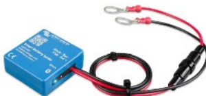
Bluetooth sensing: Smart Battery Sense