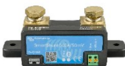
Bluetooth sensing: SmartShunt