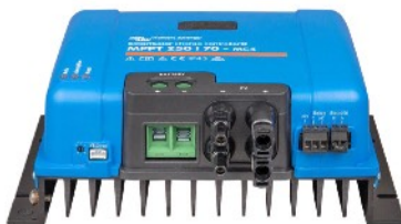
SmartSolar Charge Controller MPPT 250/70-MC4 without display