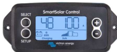
SmartSolar pluggable display

Simply remove the rubber seal that protects the plug on the front of the controller, and plug-in the display.