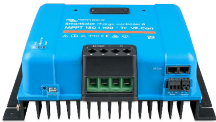
SmartSolar Charge Controller MPPT 150/100-Tr VE.Can without display