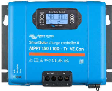
SmartSolar Charge Controller MPPT 150/100-Tr VE.Can with optional pluggable display