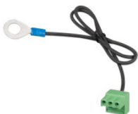
Connector with preassembled DC minus cable (included)