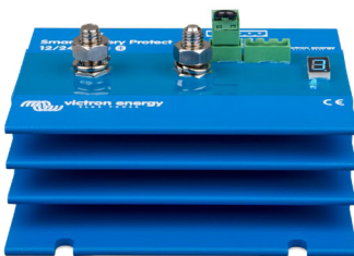
Smart BatteryProtect BP-220