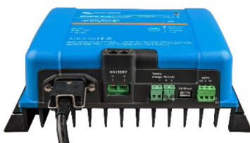
Phoenix Smart 12/50(1+1)