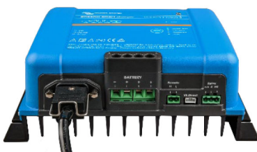
Phoenix Smart 12/50(3)