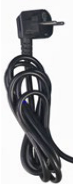
AC cord (must be ordered separately)

Plug options: Europe: CEE 7/7 UK: BS 1363 Australia/New Zealand: AS/NZS 3112