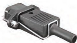
Retainer clip (included)