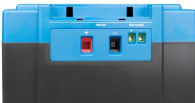
High capacity output (mover) and low capacity output (domestic)