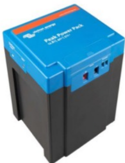
12.8 V, 40Ah