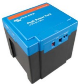
12.8 V, 30Ah