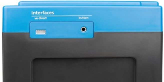
VE.Direct and push-button