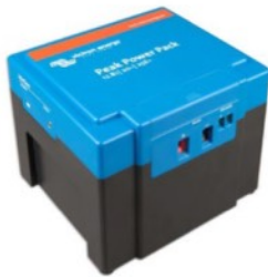
12.8 V, 20Ah