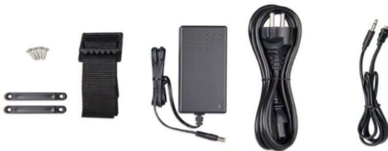
Fixing strap Adapter Power cable Push-button with cable (2m) and dual-colour LED