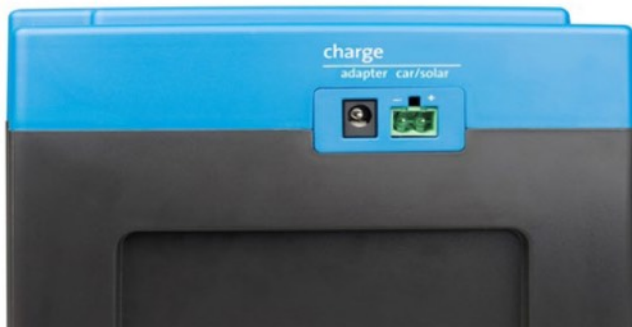
Adapter and car/solar inputs (plug for the car/solar input is included)