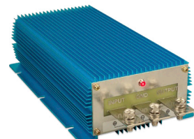
Orion IP67 24/12-100 Orion IP67 12/24-50