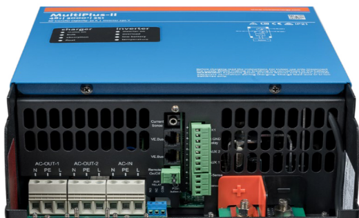
Connection Area MultiPlus-II 3K