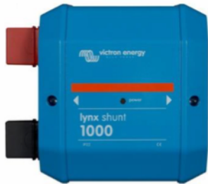
Lynx Shunt VE.Can