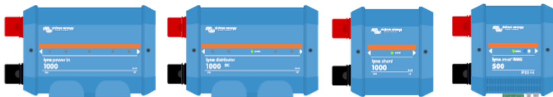
The Lynx modules: Lynx Power In, Lynx Distributor, Lynx Shunt VE.Can and Lynx Smart BMS