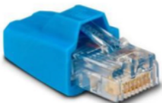
RJ45 VE.Can terminator