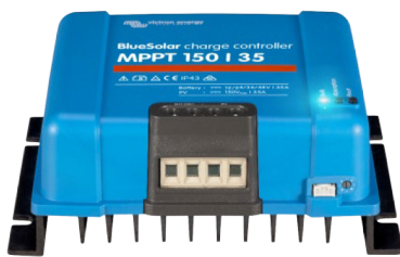
Solar Charge Controller MPPT 150/35