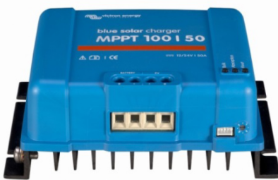
Solar Charge Controller MPPT 100/50