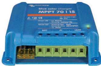
Solar Charge Controller MPPT 75/15