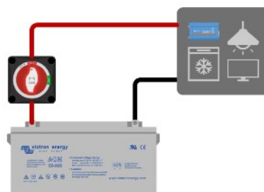
The Battery Switch is used to isolate the battery from a DC system.