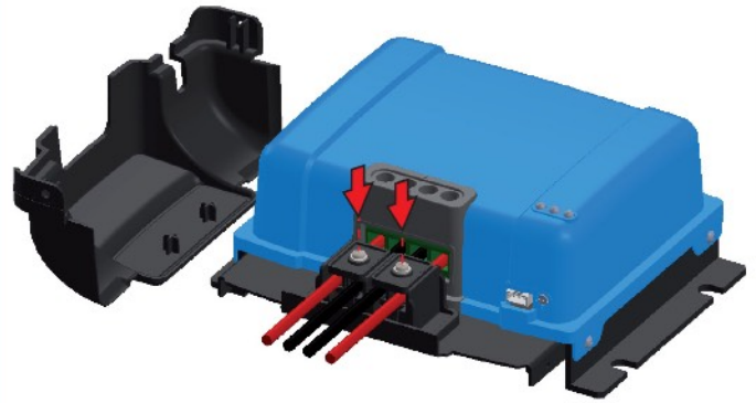
STEP 2: After mounting the MPPT to the wall, secure the cables.