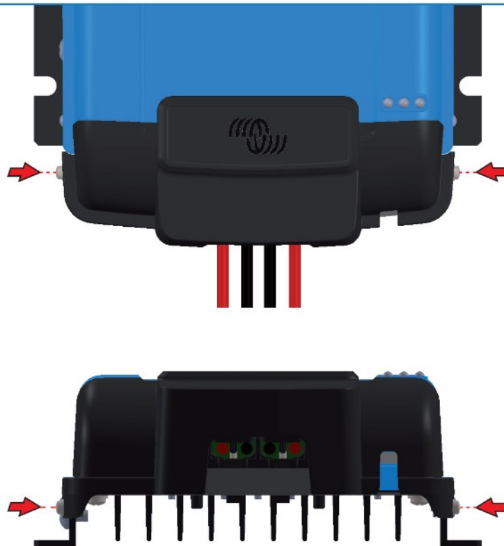
STEP 3: Place the WireBox cover and fasten with two screws.