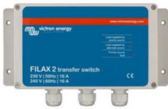
Filax 2: ultrafast transfer switch