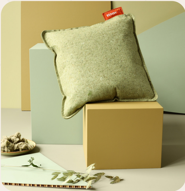
PLOOV heat cushion Colors: Marble grey, Moss green, Dune beige, Stormy blue. Dimensions // Price: 45 x 45 cm // 119,95 €