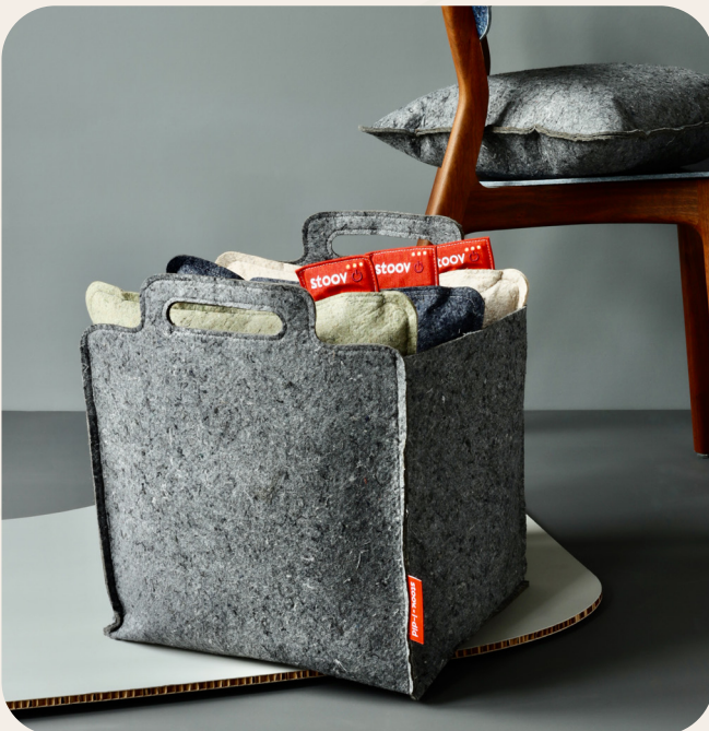
BASKET storage basket Colors: Marble grey, Dune beige Dimensions // Price: 40 x 36 x 39 cm // 49,95 €