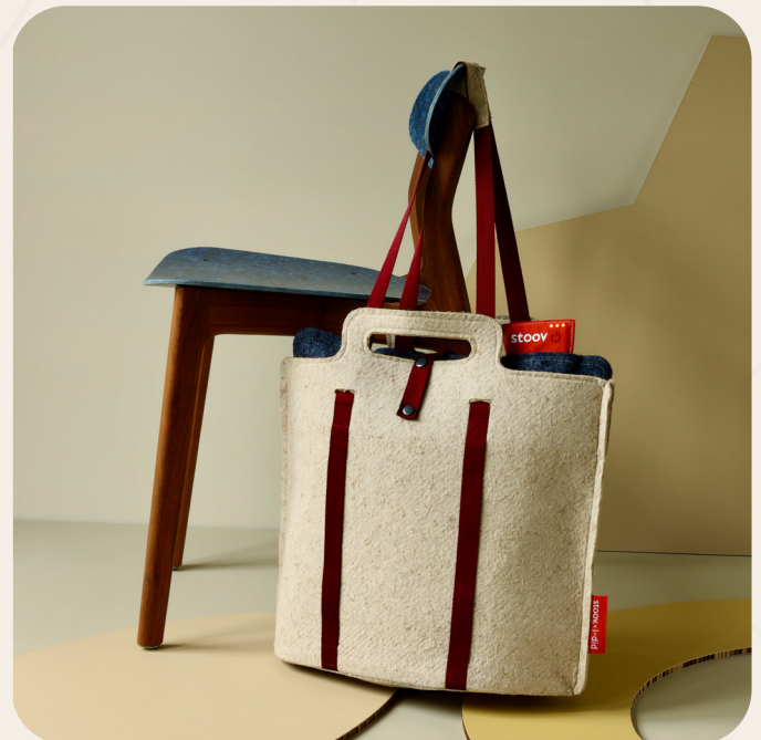
BAG carrying bag Colors: Dune beige, Storm blue Dimensions // Price: 50 x 18 x 39,5 cm // 69,95 €