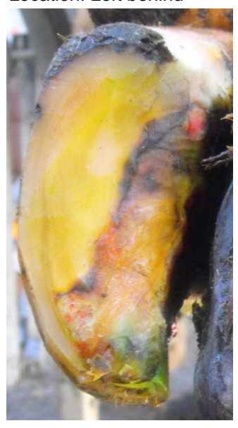
Day: 28 Score: 1 Remark: -