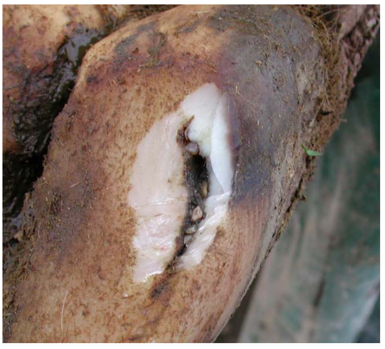
Photo 2. - Solid foreign bodies may lodge in the softened, widened zone of the White Line.

The white line is an extension of the lamellae and is composed of soft horn joining the sole to the wall. White line disease is believed to be strongly associated with subclinical laminitis. It is postulated that stretching of collagen fibers, combined with sinking of the pedal bone, accounts for the hemorrhage into the white line that is so frequently observed. Rupture of the white line is exacerbated by the impact of locomotion, particularly among animals housed on concrete. The abaxial region of the wall of the hindlimb is the area of the claw absorbing the concussion of the first impact of locomotion. Solid foreign bodies may lodge in the softened, widened zone. They may push through to the corium beneath and introduce infection; however, the presence of a foreign body is not essential for the lesion to develop.