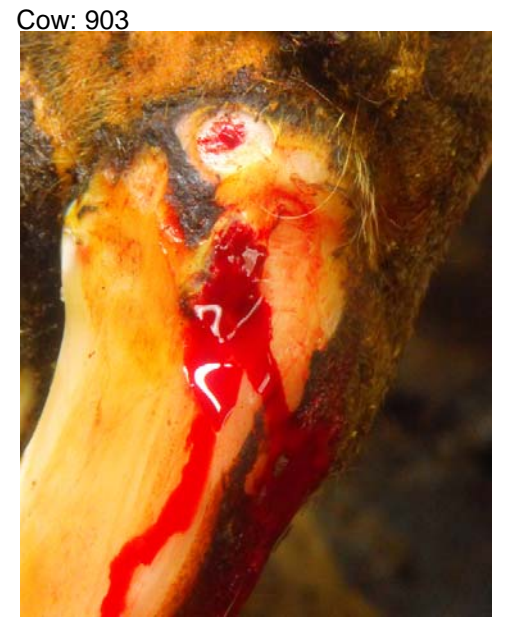
Day: 1 Score: 3 Remark: -