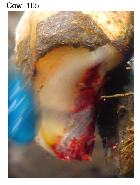
Day: 1 Score: 3 Remark: -