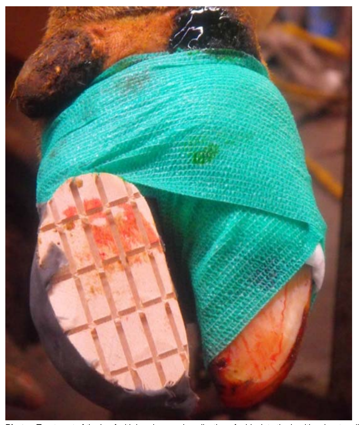
Photo.- Treatment of the hoof with bandage and application of a block to the healthy claw to relieve pressure of Cow 903

Location clinical trial: Farm dairy farm in the state Groningen of the Netherlands, farm with 200 cows of MRIJ/Red Holstein Friesian with concrete floor.