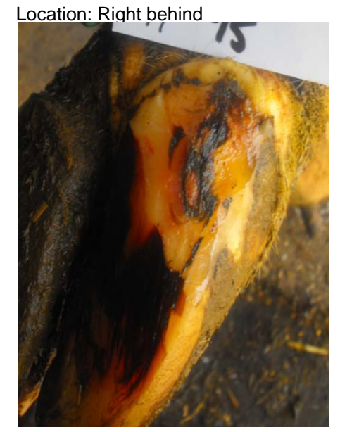
Day: 28 Score: 0